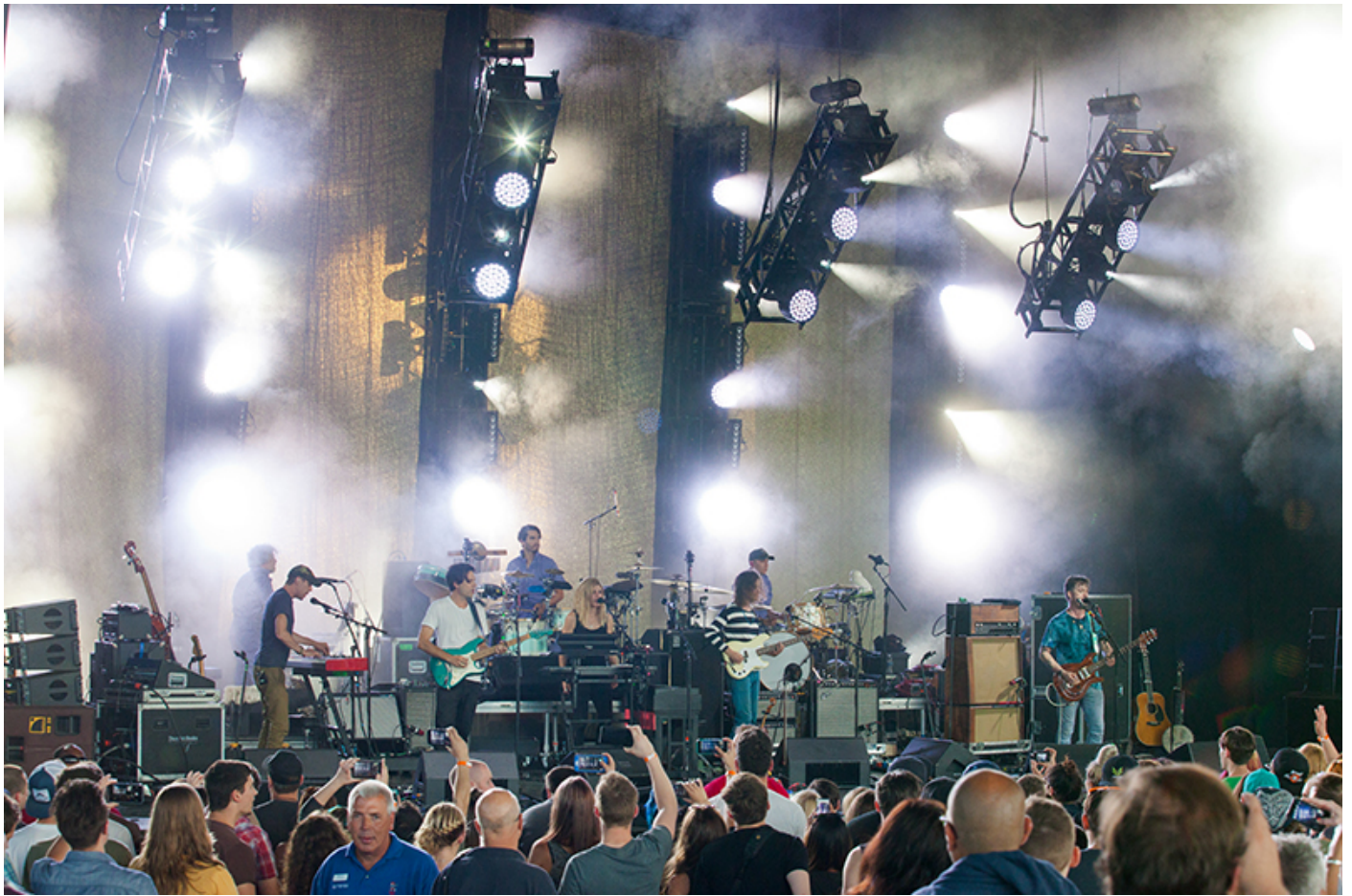
Modest Mouse tour