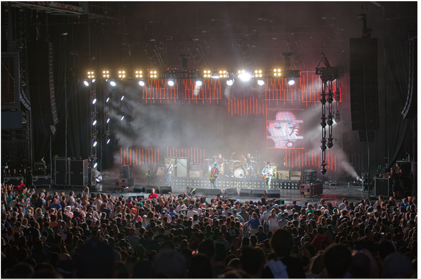
Brand New tour